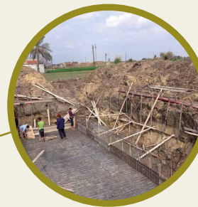
Construction of the compact treatment plant.

LOCATION: Al Gozayyera village, Ismailia Governorate, Egypt