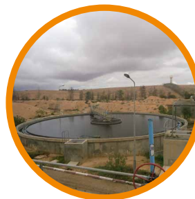
Existing treatment facilities of Médenine Wastewater Treatment Plant.