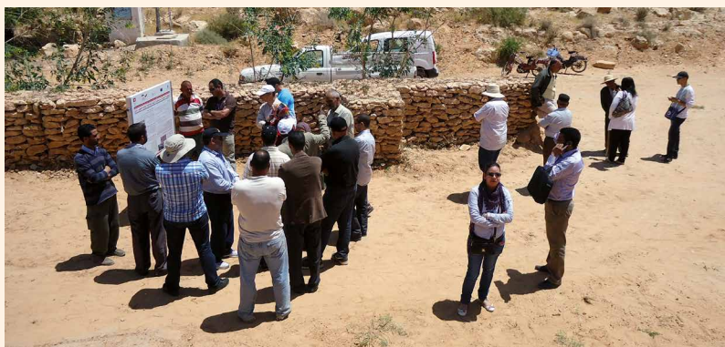
Visit of the pilot site in Médenine organised during the regional training in Djerba, Tunisia.

Within Sustain Water MED, Tunisian institutions responsible for the environment, agriculture, water resources and health formed a very active steering committee. This provided a valuable platform for discussing the institutions' respective responsibilities and interests. Their joint work in the project's steering committee has contributed to better cross-sectoral exchange of experiences and understanding.