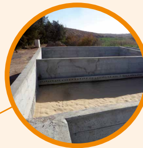
Constructed sand filter of Médenine Waste Water Treatment Plant.

Source Map: Made with Natural Earth, 2015. Source Picture: GIZ