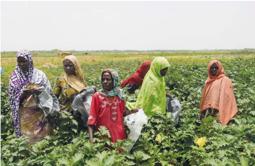
The water of Lake Chad sustains agriculture in the Sahel region. Here: Women working in a plantation in Chad